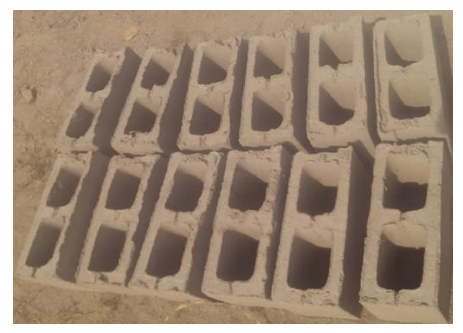
Fig. 2. Blolocks produced from 4% sawdust replacement for sand

Fig. 2. a. Blocks produced from 0% sawdust replacement for sand. b. Blolocks produced from 2% sawdust replacement for sand