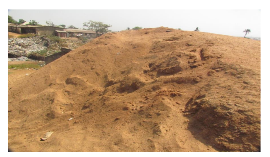
Plate1: Heap of sawdust at Timber Shed along New Bridge Road Wurukum, Makurdi.