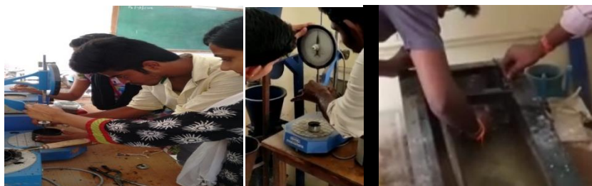
Fig 4 – Penetration and Ductility Test

Ductility test: the material is heated between 75-100°C. The mix was stirred continuously to remove air bubbles and water, and filtered through IS Sieve 30. The mix is cooled for 30 minutes. Experiment is carried and the final breaking point of the bitumen mix is noted, the result are shown in table – 4.