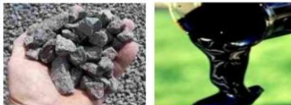
Fig 1 – Coarse Aggregate and bitumen

emulsions or heavier grade tars may also be used. In this research work, we used the bitumen grade of 60/70.