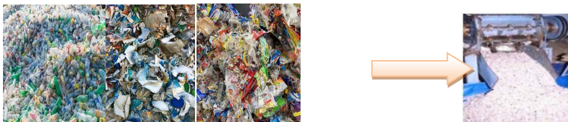
Fig 2 –Processing Waste Plastic

Waste Plastic bottles, LDPE/HDPE bags, Wrappers are collected from the nearby houses and apartments and from the dump yards. The collected plastic wastes are dried for 48hrs and were taken to nearby shredded garage. From the garage we obtained shredded plastics of size less than 4.75mm about 30% and much fined particles less than 2.36mm about 70%.